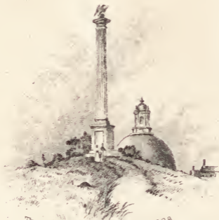
The Summit of Beacon Hill, 1808.

PUBLISHED BY Small Maynard & Company BOSTON